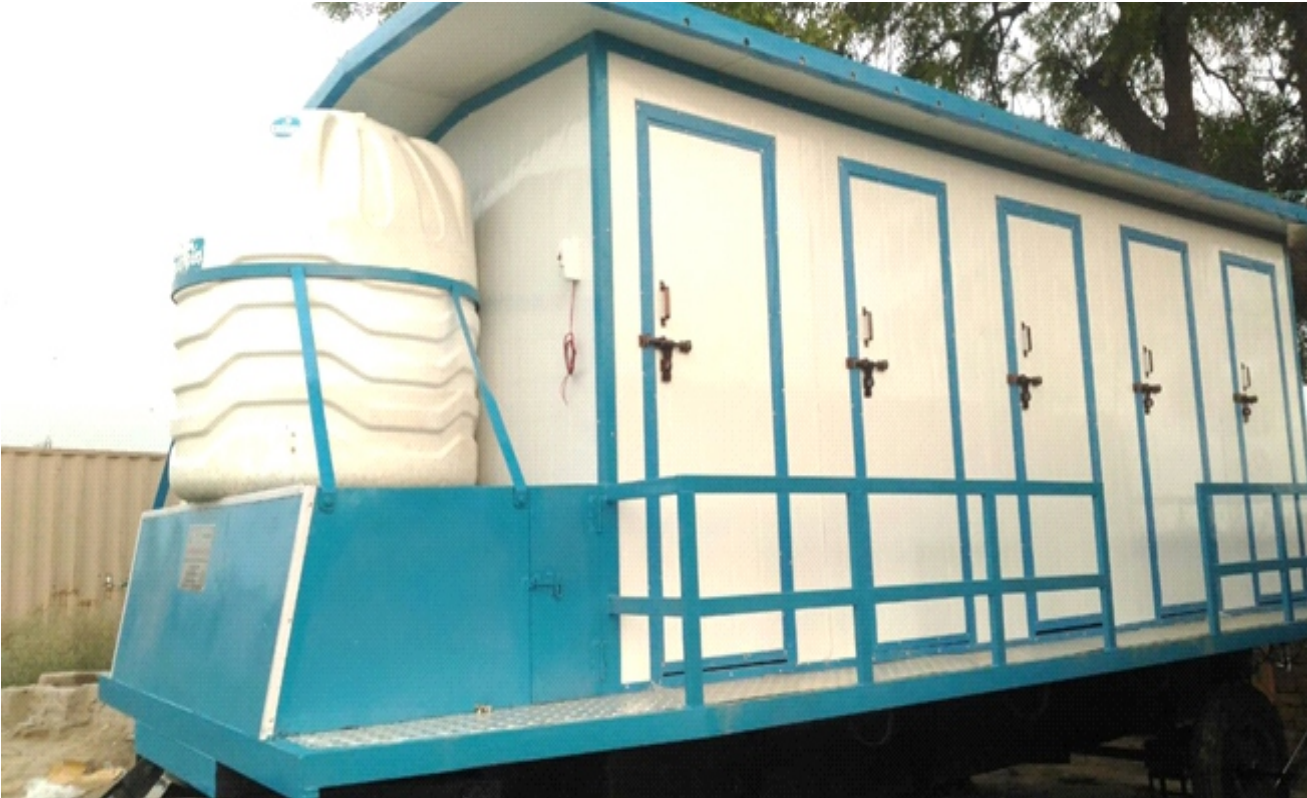
PPGI PUF MOBILE TOILET VAN