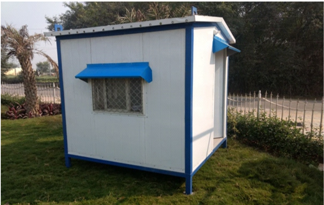
SINGLE SIDE SLOPE & HUT TYPE