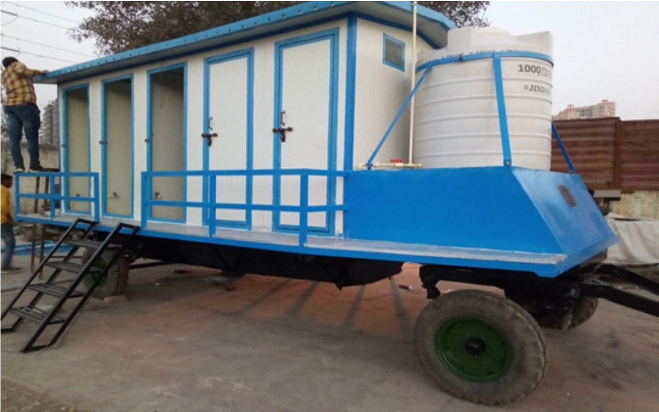
10 SEATER MOBILE TOILET VAN