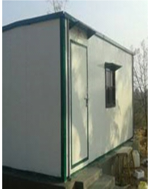
PORTABLE SITE OFFICE