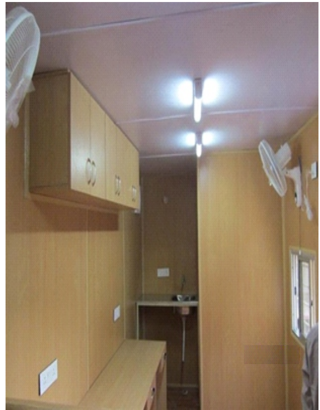
OFFICE WITH WORKSTATION & TOILET AND PANTRY ARRANGEMENT