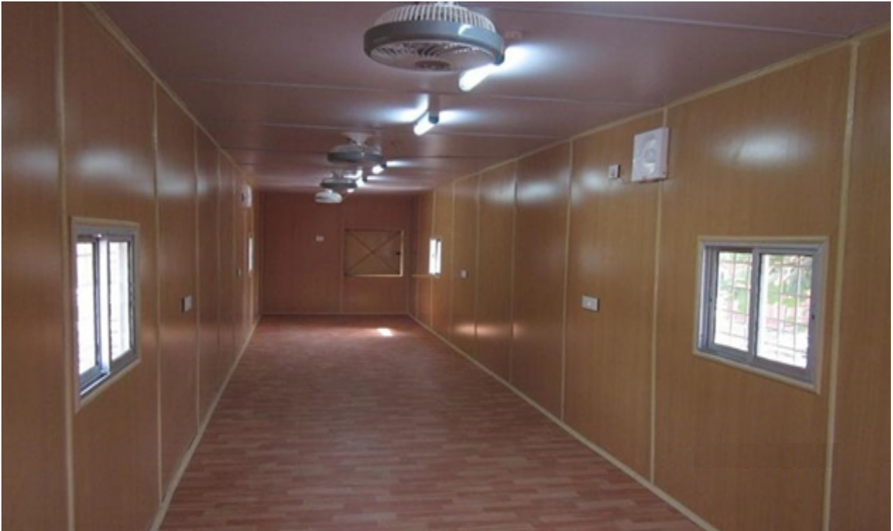
HALL TYPE OFFICE CONTAINER